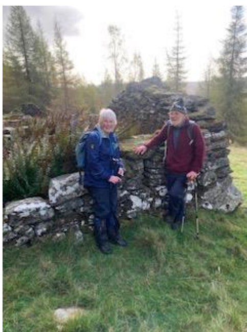
by old settlement on Craig Fonvuick

I have just been reading how I started the December 2022 Newsletter and I referred to it as being the wettest November I could ever remember. I don't know how the statistics of November 2023 compare with that of a year ago but October 2023 certainly broke all records and living in Perth, I was, just after mid day on Sunday 8 th October, along with a significant number of Perth residents, watching the very late closure of the flood gates on Tay Street taking place, while puzzling over how the North Inch seemed to be flooded when flood gates existed that should have prevented this!! Twelve days later there were red flood warnings over much of Tayside but it was Brechin that was suffering the most from the next deluge. However road travel throughout Tayside over the weekend of the 21 st / 22 nd was difficult. The Sunday in between (15 th October) was a beautiful Autumn day and three members completed the actual walk advertised on the Walks Programme! This was starting from the Garry Bridge car park, transversing the 413 metre Craig Fonvuick to Killiecrankie where the River Garry was crossed and then returning to the Garry Bridge by the path on the East side of the river which passes the Soldier's Leap landmark. October is a good month for this walk as the Killiecrankie area is especially good for Autumn colours.