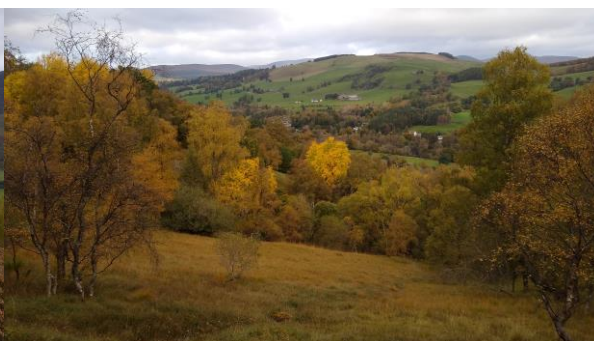
view towards Killiecrankie

A different group of three went out on 12 th November and in anticipation that none of that group would be out on the 26 th November, due to heavy involvement in the Dundee