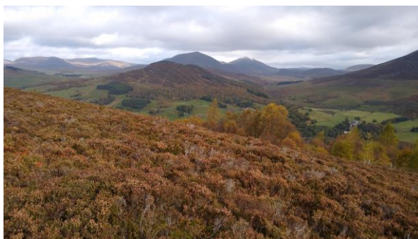
view to Glen Tilt hills