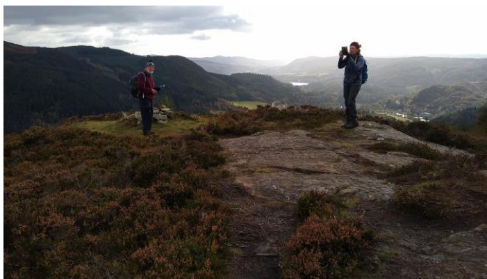
view South from Craig Fonvuick summit